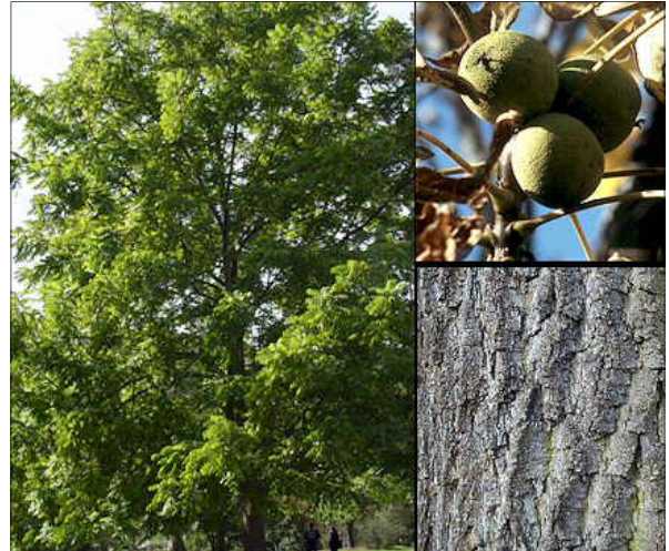
Black Walnut trees are common in North America