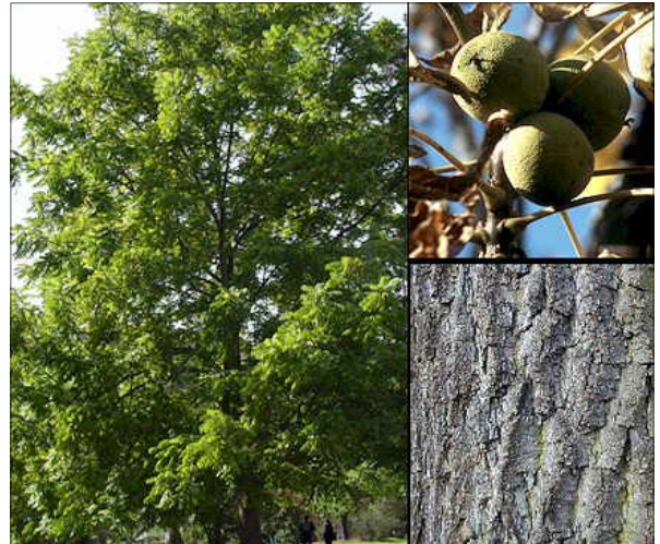
Black Walnut trees are common in North America