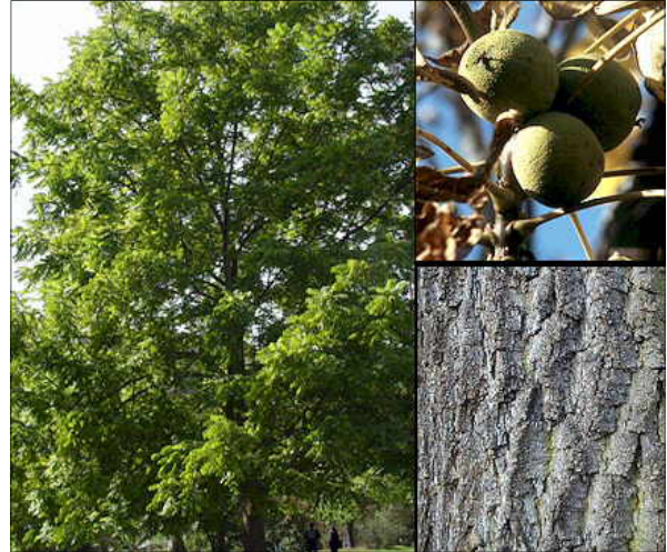
Black Walnut trees are common in North America